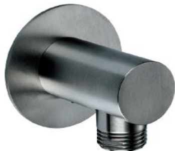
Immagine Prodotto - Product Image

водорозетка из нержавеющей стали 1/2"M x 1/2"M gas