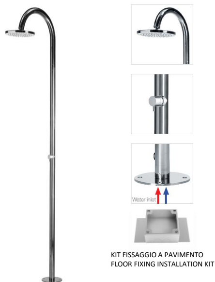
Immagine Prodotto - Product Image

Душевая колонна Оки, из стали INOX AISI 316, с подключением к водоснабжению встроенному в пол. Комплект душевой колонны состоит из: Комплект для крепления к полу и подключению к водоснабжению (горячему и холодному) - 1 крана смесителя - Душ OKI diam. 200 или