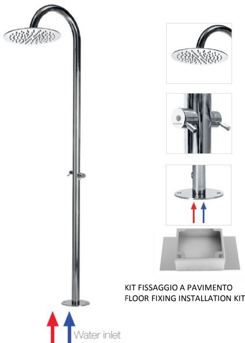
Immagine Prodotto - Product Image

Душевая колонна TETIS из стали INOX AISI 316, Душевая колонна укомплектована: Комплект для крепления к полу и подключению к водоснабжению (горячему и холодному), 2 Прогрессивных смесителя, Душ TETIS диам. Ø300 мм