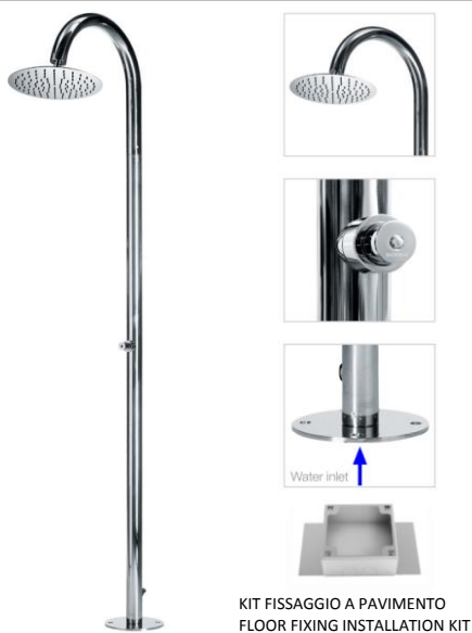
KIT FISSAGGIO A PAVIMENTO FLOOR FIXING INSTALLATION KIT