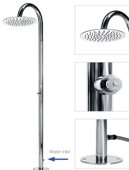
Immagine Prodotto - Product Image

Душевая колонна TETIS, из стали INOX AISI 316, соединение на 3/4" M для подключения наружного водоснабжения (холодному) - Вентиль подачи на время - Душ TETIS диам. Ø250 мм