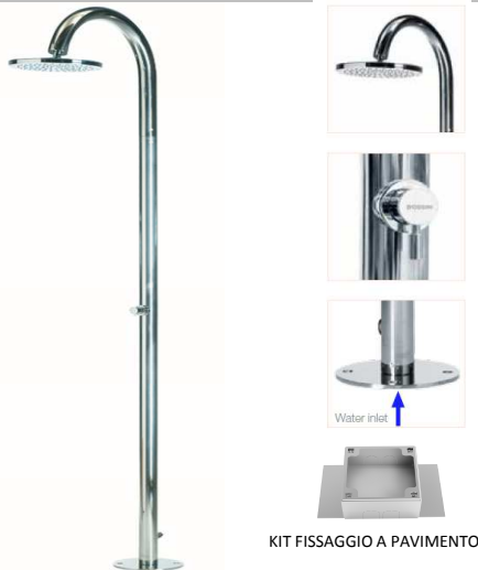
Immagine Prodotto - Product Image

Душевая колонна OKI из нержавеющей стали AISI 316 с комплектом для установки на пол, подключение 3/4" M для внешнего водоснабжения холодной водой с запорным вентилем - Душ OKI Ø 200 мм