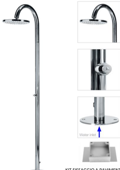
KIT FISSAGGIO A PAVIMENTO FLOOR FIXING INSTALLATION KIT