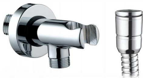
Immagine Prodotto - Product Image