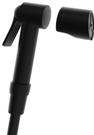
Immagine Prodotto - Product Image

Комплект: гигиенический душ с кнопкой APICE из АБС-пластика (61 отверстие). Держатель для душа. Шланг Cromolux 125 см.