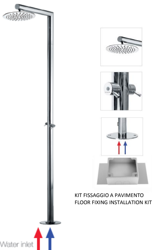
Immagine Prodotto - Product Image

Душевая колонна NEK из стали INOX AISI 316, Душевая колонна укомплектована: Комплект для крепления к полу и подключению к водоснабжению (горячему и холодному), 2 Прогрессивных смесителя, Душ TETIS диам. Ø300 мм